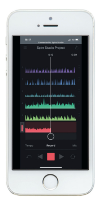
Spire Music Recorder shows vour Spire Studio projects, plus effects, mixing and more control

The Metronome lives on a dedicated page, and features a useful animated visual along with its click. It supports 4/4, 3/4, 6/8 and 1/4 time signatures, and the tempo is set manually or by poking at the Tap button. It's a real shame you can't use it with Spire Studio standalone.